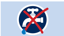
No water required